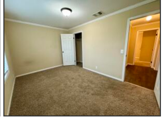
Bedroom 1 IMG_0392